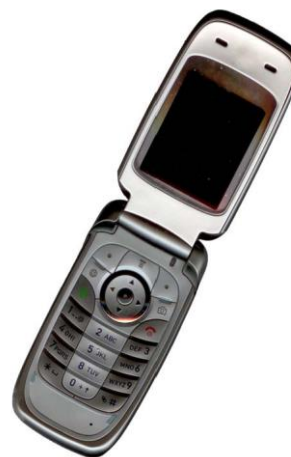
Fig. 3. Example of an image with acceptable resolution