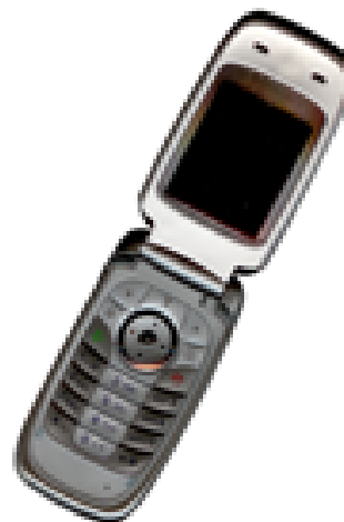
Fig. 2. Example of an unacceptable low-resolution image